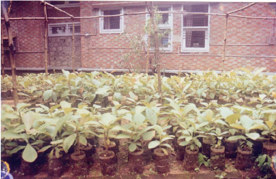
Plate.1. Cloned ramets of plus trees after open hardening ready for field planting

The properly rooted cuttings of each plus tree were labeled and removed to the hardening chamber, where these were kept for about 45 days in order to allow them to harden properly. The cuttings were also hardened in the open nursery for few days in order to acclimatize before being taken to the field for planting out.