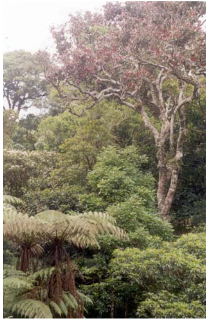
Fig 6. Evergreen forest, Upper manalar

growing to two meters occupy vast regions in the reserve. Amidst these are fire resistant trees like Anogeissus latifolia , Bridelia retusa , Emblica officinalis , Careya arborea , Kydia calycina , Grewia tiliaefolia , etc. These were probably wooded regions earlier and has been reduced to grassland due to frequent fire. Marshes and lake shore have succulent grass like Panicum sp.