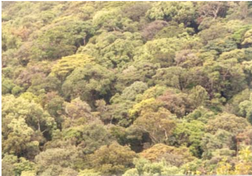
Fig 4. Aerial view of evergreen forest

The vegetation of Periyar Tiger Reserve has been studied in detail. Chandrasekharan, in "Forest types of Kerala" gives general forest types and area under each of these. French Institute, Pondicherry has prepared a map of the vegetation at 1:250,000 scale. The flora of the reserve was studied in detail by Sasidharan (1998). In this study characteristics of forest was examined with the help of sample plots taken during the base line mapping. Tree composition from sample plots and profiles of vegetation are given separately. As part of the project supervised classification of forest using satellite imagery is attempted.