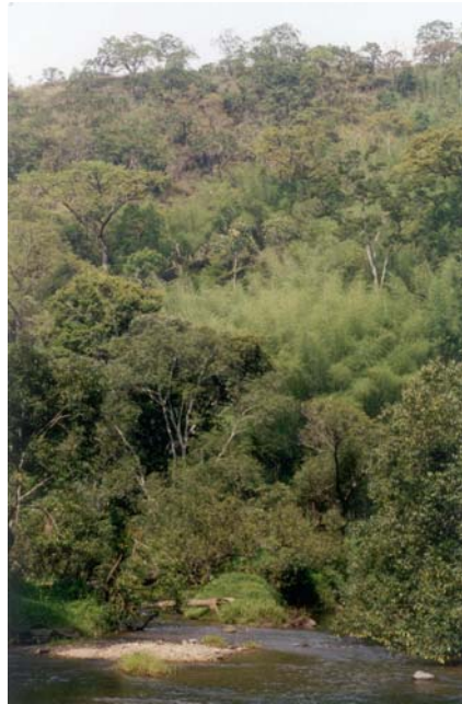
Fig 7. Bamboo area - Mullakudy.