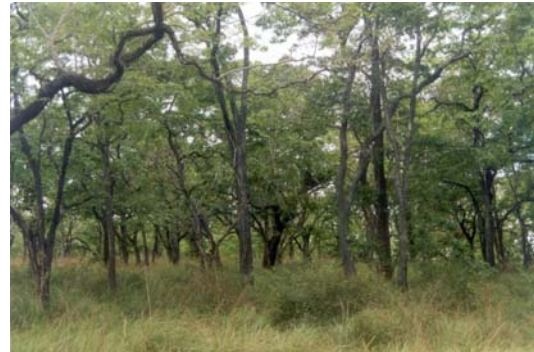
Fig 5. Moist deciduous forest, Chevaloda

Chandrasekharan classifies the forest of the reserve into evergreen, deciduous, and grassland types. The evergreen forest occupy an area of 305 sq. km., semi evergreen 275 sq. kms., moist deciduous 98 sq. km. and grassland 12 sq. km. French Institute Pondicherry in their vegetation map prepared in 1997 classifies the forest into the following types. Evergreen is classified into high elevation, medium and low elevation. They also described savannah and deciduous type of forest. In evergreen forest the trees are high, canopy is almost closed and is made predominantly of soft-wood species. Common species found are Mesua nagassarium , Elaeocarpus tuberculatus , Canarium strictum , Evodia lunu-ankenda , Nephelium longana , Cullenia exarillata , etc. Reeds are found in wet areas. Undergrowth consists of Strobilanthus sp. , Psychotria sp. , Laportea crenulata , Curcuma sp. , Clerodendron sp. etc. various climbers (canes, Accacia sp. , pepper) are also present.