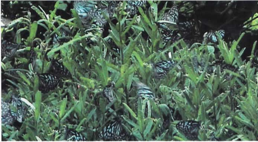
Aggregation of blue tiger on Crotalaria retusa in the Butterfly Garden at KFRI