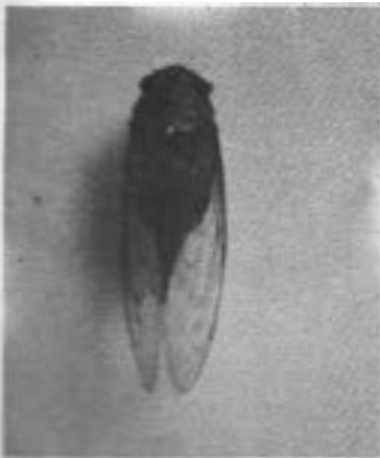
Fig.1. Platylomia unicta

The cicadas are apparently defenceless creatures and are victims to many enemies. Among their main persecutors, mention must be made of species of preying mantis, dragon-flies, hornets, wasps, robber flies, spiders and many birds. Their worst enemy however appears to be Calotes versicolor , a lizard, which takes a heavy toll of the cicadas.