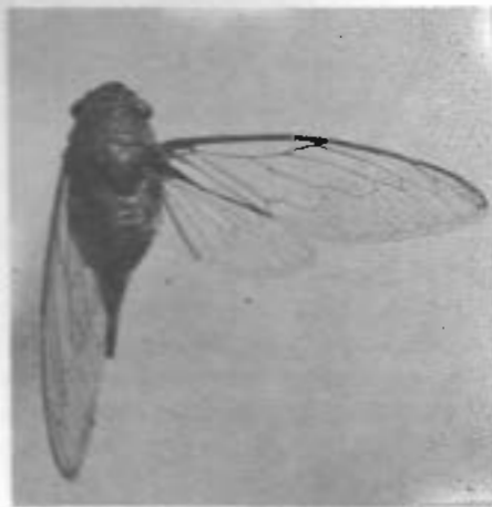
Fig.2. Platylomia sp.