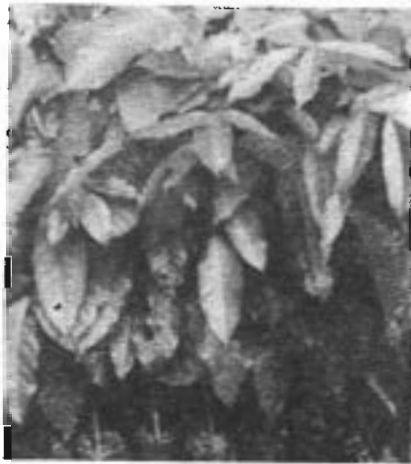
Fig.2. Containerised seedlings of S. macrophylla

dia through the India office in 1872. The emerging seedlings were soon noticed to be different from those of the true mahogany, and when the trees flowered and fruited in their twelfth year, the material available was examined by Dr. King, who described it as a new species, Swietenia macrophylla King. S. macrophylla grows more rapidly and thrives better than S. mahagoni . In Kerala, planting experiments with mahogany, both S. macrophylla and S. mahagoni were initiated in 1872 and have been continued in different localities subsequently. A plantation of both S. macrophylla and S. mahagoni was raised as early in 1893 at Edakode, Nilambur. S. macrophylla recorded comparatively good growth than S. mahagoni . Earlier planting of S. mahagoni under teak at Nilambur was a failure as the trees cannot tolerate much shade.