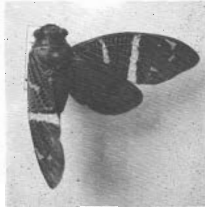
Fig.3. Gacana atkinsoni