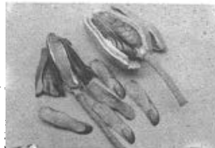
Fig.1. Seeds of S. macrophylla

Mahogany trees are monoecious. The flowers are pollinated by insects. The fruits are woody capsules and take 10 to 11 months to mature. As the capsule dries, the valves drop off, leaving the seeds exposed but still attached to the columella. They are released when a strong wind breaks the columella. Strong wind