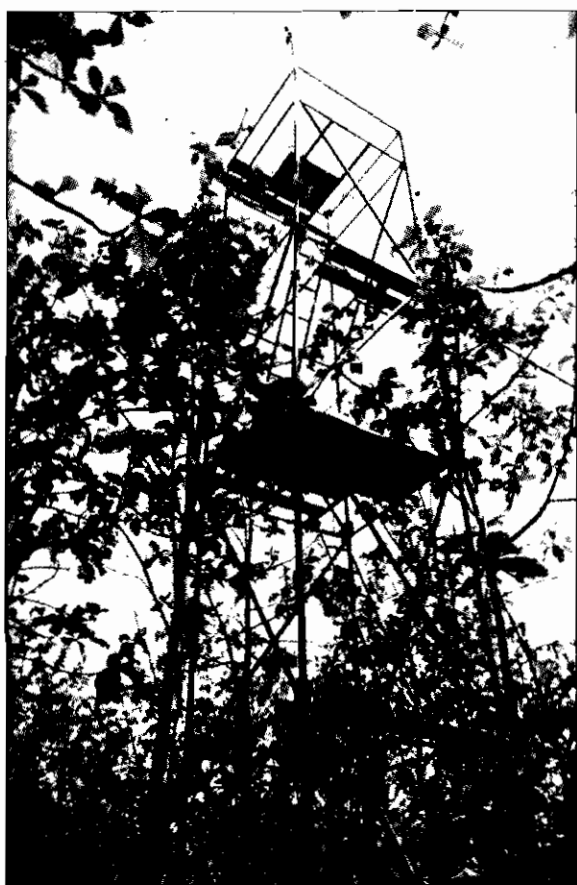
Scaffold tower erected in a teak plantation to monitor the microclimatic and physiological parameters.

density of the above trees in a plantation is several times less than the other tree species studied. The water use of a tree is also not directly related to its age. Studies conducted elsewhere have shown that eucalypts achieve their maximum water use capacity when they are 4-5 years old.