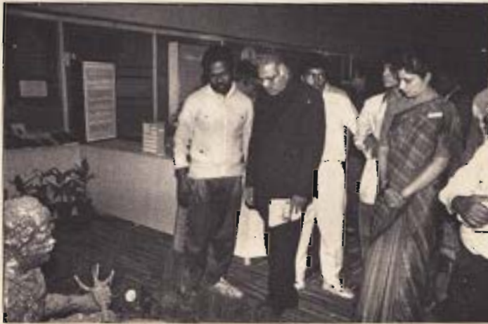
Shri. P.J. Kurien M.P., Ex-Union Minister, visiting KFRI stall.