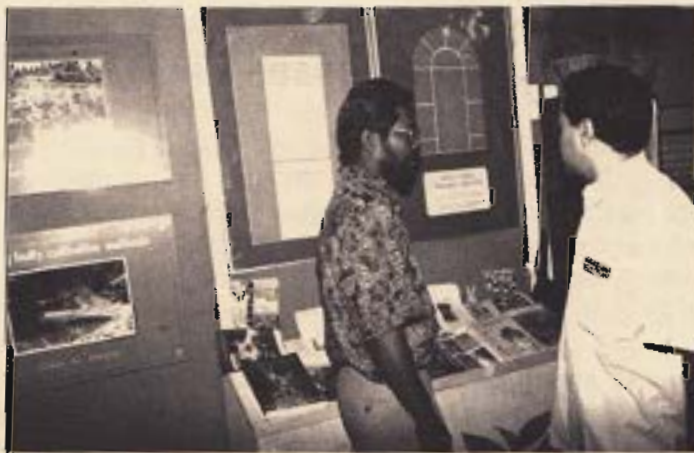
Shri. P.K. Kunhalikutty, Hon. Minister for Industries, Kerala visiting KFRI stall.