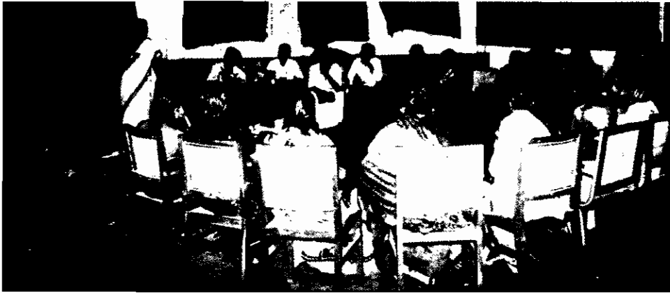
Training programme for rural women on tree species

A training programme for rural women on 'species diversity, protection, conservation and sustainable management of the tree component in the homegarden agroforestry systems' was organized at the Institute on 19-20 June 1993. The programme was sponsored by M.S. Swaminathan Research Foundation (MSSRF), Madras. Participants in the training programme included 19 women from Panancherry Panchayath (Thrissur District) and three others from non-governmental organizations.