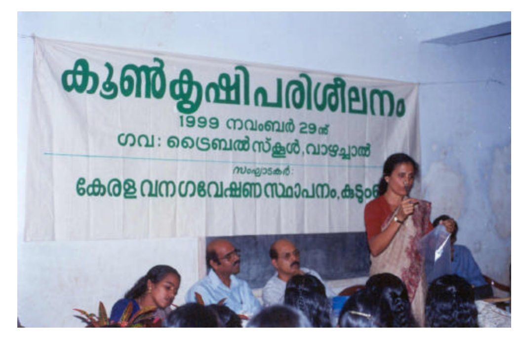
Fig. 7 Introductory class on cultivation of edible

A one-day training was conducted on mushroom cultivation using forest litter for the benefit of tribals at Vazhachal area (Fig. 7). Altogether 77 tribes from different