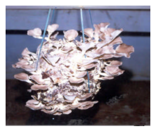
Fig. 5 Pleurotus sajor-caju

and ortho- dihydroxy phenolics content of the substrate (Sivaprakasam, 1980). Cellulose rich organic substances have been reported to be good substrates for the cultivation of mushrooms (Quimio, 1978). This may be the reason for the higher yield of mushrooms when paddy straw was used as the substratum. The colour of the mushroom, P.sajor-caju was more whitish in paddy straw where as, in leaf litter it was slightly brownish (Fig. 6).