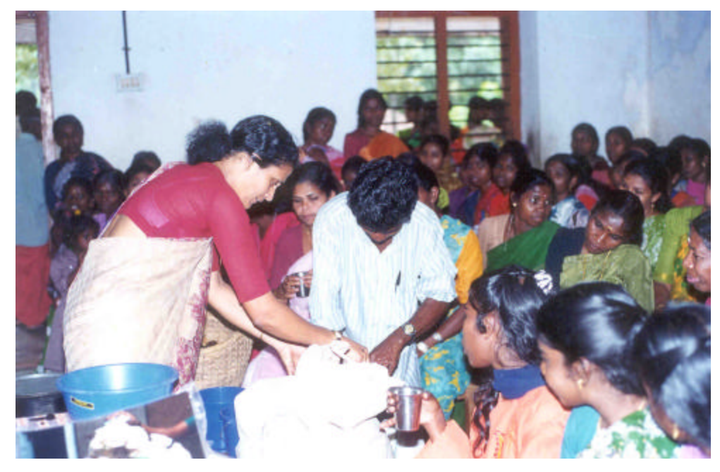
Fig. 9 A trainee fills the polythene bag with leaf litter and mushroom spawn

Individual trainees were allowed to fill one bag each (Fig. 9). A pamphlet on 'Cultivation of Mushroom'' (Koonkrishi) in Malayalam (Appendix) was released on the same day. A packet of mushroom spawn, polythene covers and a copy of the pamphlet were distributed to all the trainees to encourage mushroom cultivation.