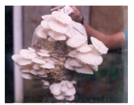
Fig. 4 Pleurotus florida