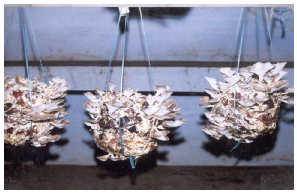
Fig. 2 Mushroom beds hung from the top