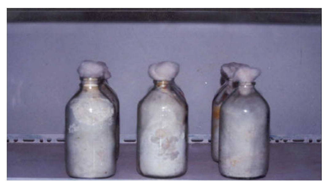
Fig. 1 Fully grown mushroom spawn of P. florida

Jowar was used as the grain for preparing spawn. The grains were cleaned thoroughly of chaff and dirt and soaked in clean water for 5-6 hours. They were then boiled till turned soft. Overboiling should be avoided since the grain will split open and starch will ooze out from the grain. The excess water was drained off and the grains were spread over a clean polythene sheet for cooling. The grains were then thoroughly mixed with Calcium carbonate 40 g (CaCo<sub>3</sub>/kg<sup>-</sup> of grain). This mixture was then filled in narrow mouthed bottles/conical flasks, plugged with cotton and sterilised for 2 consecutive days at 100 kPa for 30 min. Calcium carbonate absorbed excess water and helped to avoid clumping of grains and also to maintain optimum pH. After sterilisation, the bottles were inoculated with mycelial bits from the mushroom culture raised in petri dishes and incubated at 25\pm1^{\circ} C for 3 weeks. The fungal mycelium covered the grain + CaCo<sub>3</sub> mixture within this period and this was used as mother spawn (Fig. 1).