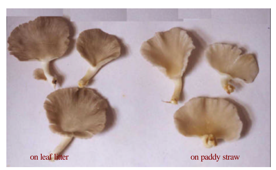
Fig. 6 Colour variation of Pleurotus florida

and ortho- dihydroxy phenolics content of the substrate (Sivaprakasam, 1980). Cellulose rich organic substances have been reported to be good substrates for the cultivation of mushrooms (Quimio, 1978). This may be the reason for the higher yield of mushrooms when paddy straw was used as the substratum. The colour of the mushroom, P.sajor-caju was more whitish in paddy straw where as, in leaf litter it was slightly brownish (Fig. 6).